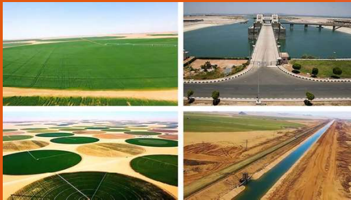
Toshka Development Project

Quasi Systems worked on numerous projects in a variety of industries, which allowed us to broaden our experience. The projects listed below are a few of our successful ones that we bid on and finished.