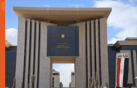
Ministries of New Capital