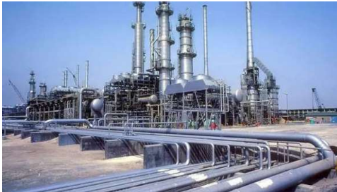
Petroleum Pipelines Co.