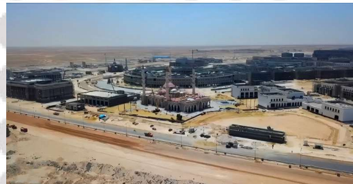
Al-Alamein Old City