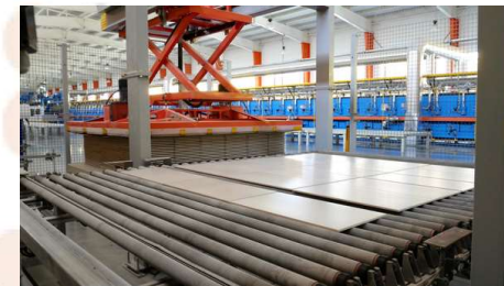
Ceramica Venezia Group