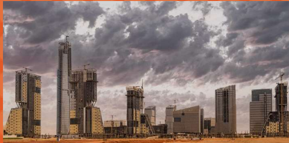
CBD Towers - New Capital