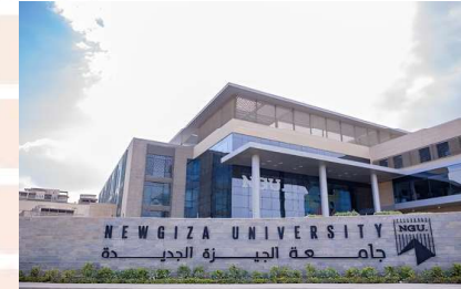
New Giza University