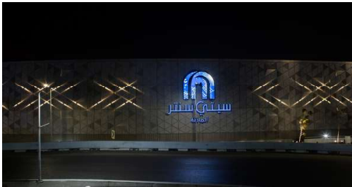
City Center Almaza